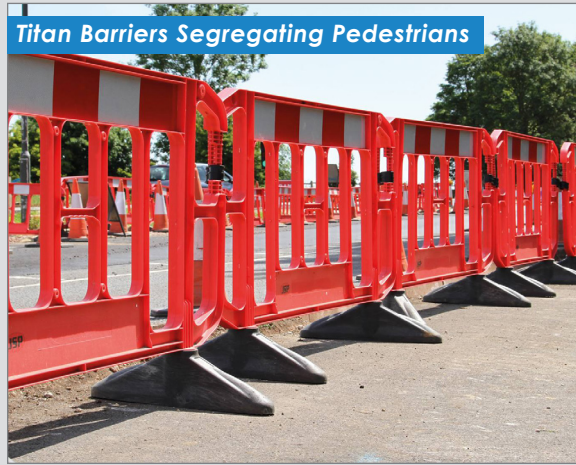
Titan Barriers Segregating Pedestrians